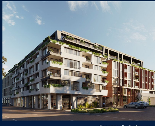
Spencer: 2 - Bedroom