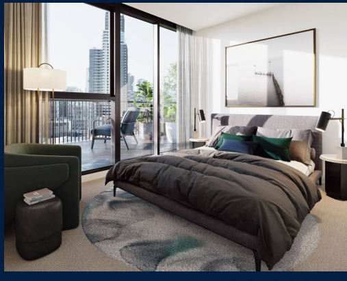
Roden: 3 - Bedroom