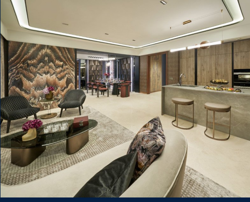
5 - Bedroom Premium