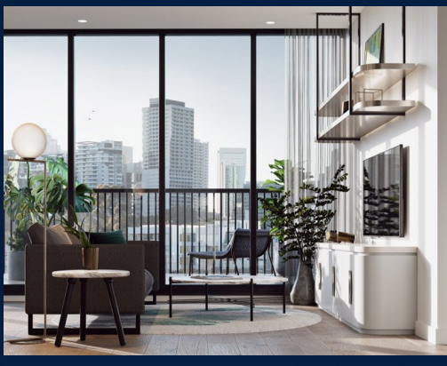
Roden: 3 - Bedrooom + Study