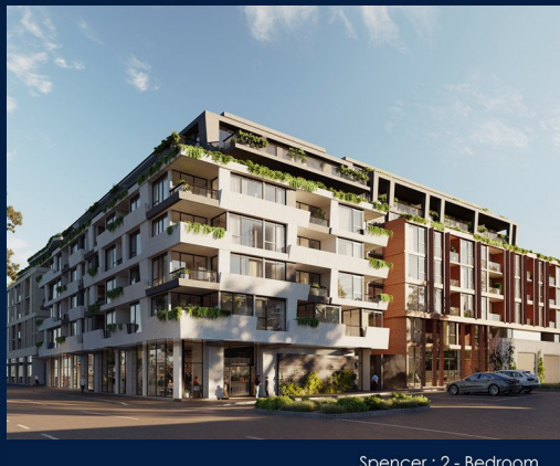
Spencer: 2 - Bedroom