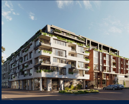
Roden: 2 - Bedroom