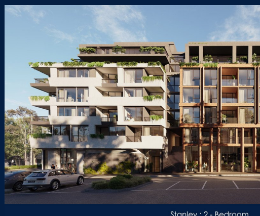
Stanley: 2 - Bedroom