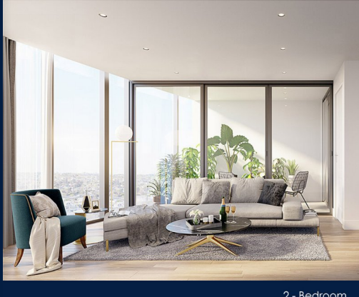
2 - Bedroom