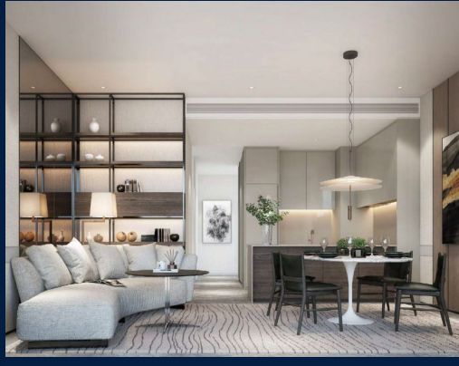
2 - Bedroom + Study